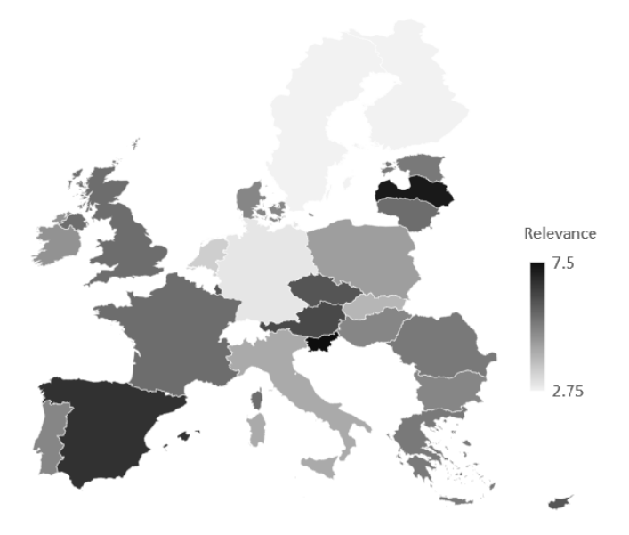
Figure 1. Relevance of the Action Plan and its objectives. Aggregate score covering perceived effects (1 to 9 rating scale) of the Action Plan as related to its objectives. Data is based on countries' responses to EQ1 in the evaluation [53].

These results provided a heterogeneous picture that did not conform to the notion that the EU Forest Strategy would be important in countries with high forest cover. These differences may not necessarily be as surprising as they appear at first glance for two reasons: (1) the economic importance and role of forest-based industries vary significantly across these countries [46,56–59]; and (2) the EU Forest Strategy is a non-binding and voluntary policy instrument [38,51,53]. Nevertheless, in contrast to our hypothesis, this would suggest that Member States that have a strong forest-based industry may simply choose to ignore the strategy, especially if it does not fit well with their national priorities.